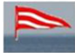
BLACK ROCK YC