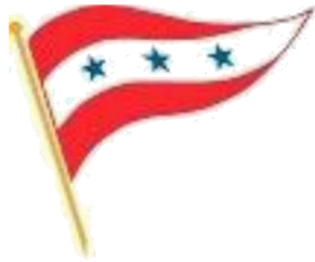
CEDAR POINT YC