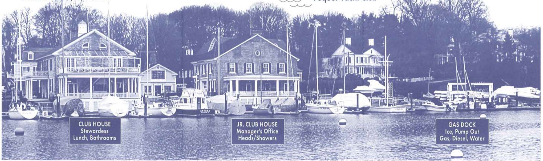
CLUB HOUSE Stewardess Lunch, Bathrooms