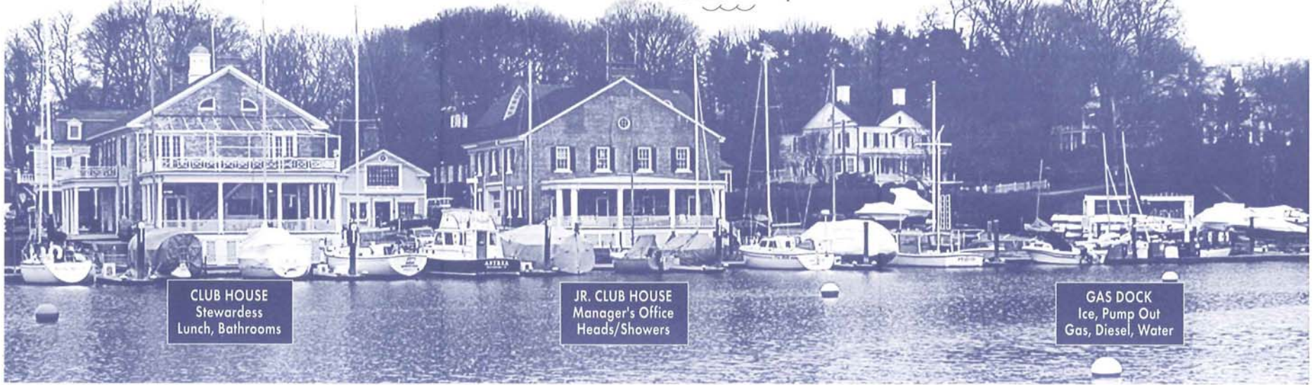
CLUB HOUSE Stewardess Lunch, Bathrooms